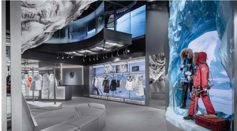
Project: BOSIDENG Flagship Store, Sanlitun Design Firm: 39 THIRTY NINE Page 76